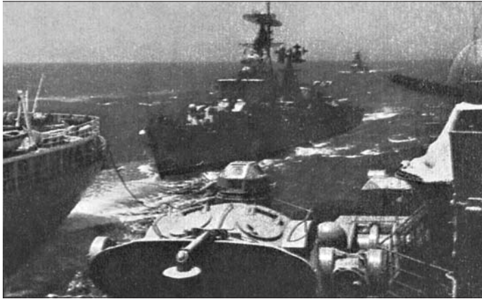
View from the cruiser Zhdanov , being refuelled in the Mediterranean, 1973

In an alarming development, on the day of Brezhnev's note to Nixon, a Soviet surface group was sent to Port Said. 167 It consisted of the Admiral Ushakov , the SAM destroyer Otvazhnyi , the SAM destroyers Neulovimyi (Kildin) and