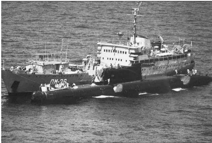
A Juliett-class submarine being repaired at sea

This experiment in naval aviation, however innovative, was never intended to offset U.S. air superiority. The Ka-25 helicopter, of which the Moskva and its sister ship Leningrad could accommodate a maximum of eighteen each, was slower and of shorter range and endurance than its U.S. counterparts, and an easy target for NATO fighters. One hypothesis is that the Moskva had been originally designed to extend the range of shore-based ASW helicopters engaged in anti-Polaris operations in the Barents Sea. In the Mediterranean, however, without proper support facilities, the ship proved ineffective, “far too small and vulnerable for operating . . . on the far side of the Straits.” 53 The many deficiencies in the Moskva's design—ranging from inadequate length and poor seakeeping characteristics in rough weather to an aircraft complement too small for its intended ASW purpose—accelerated the ship's replacement by the first full-size Soviet carrier, the Kiev (pr. 1143), which first operated in the Mediterranean in 1976. 54