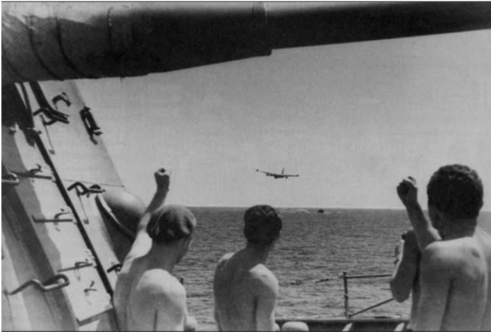
Soviet sailors shake their fists at a U.S. P2V Neptune flying over a submerging Soviet submarine in the Mediterranean.

Fleet on 1 October for a new base in Havana. 7 They faced the unenviable task of penetrating a U.S. blockade conducted by (on average) forty ships, 240 aircraft, and thirty thousand personnel. 8 In addition to this overwhelming force, the Soviet submariners were tackling immense technical and mechanical difficulties. Since Soviet nuclear submarines were at that time relatively unsafe and untested,