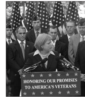
Congresswoman Nancy Boyda joins veterans at a press conference to announce a $6.7 billion increase in VA funding.

Past "Congress on Your Corner" locations include Fort Riley, Atchison, Troy, Wamego, Ottawa, Osage City, Iola, Chanute, Topeka, Hiawatha, Oskaloosa, Pleasanton, Goff, and Parsons. My office is always scheduling future "Congress on Your Corners." If you have a suggestion for a venue, please contact my Topeka office at (785) 234-8111. I look forward to visiting your corner soon!