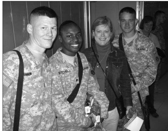
On a recent visit to Iraq, Congresswoman Boyda meets with U.S. soldiers and discusses soldier pay and benefits.