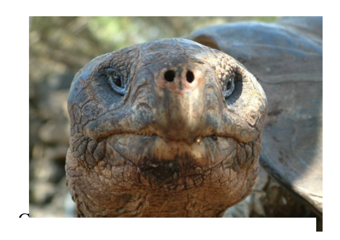
June 12-17, 2008