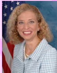
The Honorable Debbie Wasserman Schultz U.S. Congresswoman (D-FL)