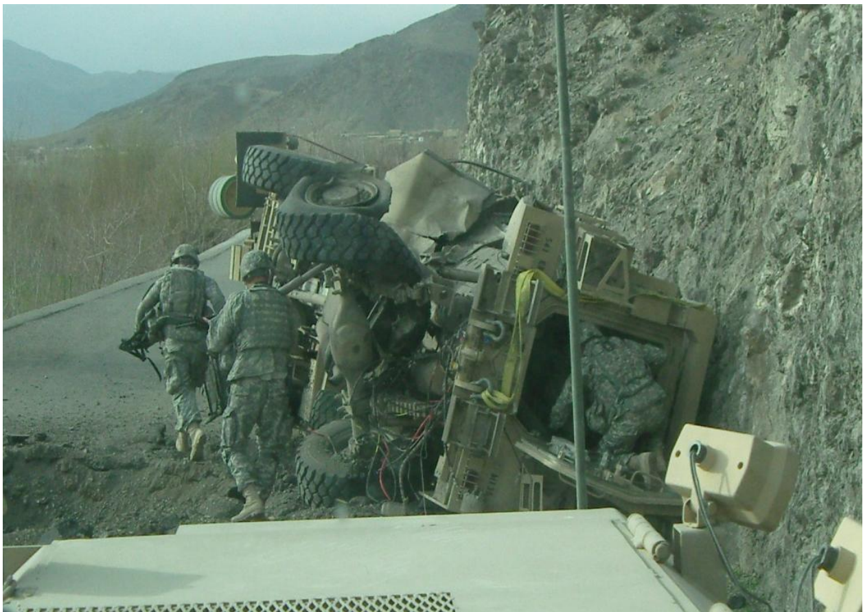
Fig. 1. March 22, 2009, ~1700 hrs local time, Tangi Valley Afghanistan. Lead vehicle in RCP 13 route clearance convoy is hit with a 500 lb IED of homemade explosive. Dismounted soldiers in the photograph are recovering casualties from the vehicle. Approximately 2 minutes after this photograph was taken, an RPG hit the cliff wall above the cab of the overturned vehicle, initiating a firefight.

our 9 o'clock position in the valley floor. Eventually the enemy would attempt to flank us at the front and rear of the convoys. Joe ran back and forth along the one lane valley road, under fire, to coordinate the movement of casualties from our forward, disabled vehicle to vehicles he guided forward during the firefight. The four casualties included one soldier with broken vertebrae, another with facial and extremity injuries, and all four suffering TBI to varying degrees. After artillery fire missions and rotary wing close air support, we gained control of the situation and evacuated our casualties and after staying the night in the position, the next day recovered our vehicle and moved out of the Tangi.