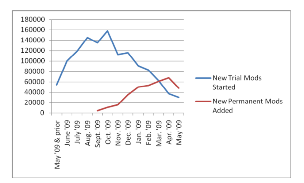
Chart 3 – New Trial and Permanent Modifications Started Under HAMP