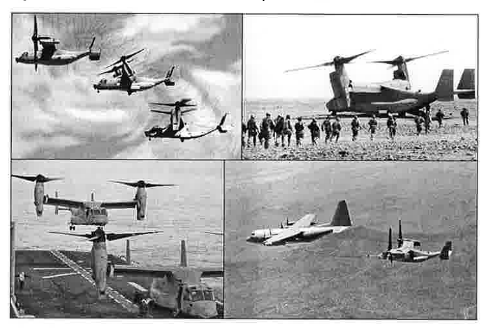
Figure 1: Views of V-22 Aircraft in Various Aspects of Use

The V-22 Osprey is a tilt-rotor aircraft—one that operates as a helicopter for takeoffs and landings and, once airborne, converts to a turboprop aircraft—developed to fulfill medium-lift operations such as transporting combat troops, supplies, and equipment for the U.S. Navy, Marine Corps, and Air Force special operations. Figure 1 depicts V-22 aircraft in various aspects of use.