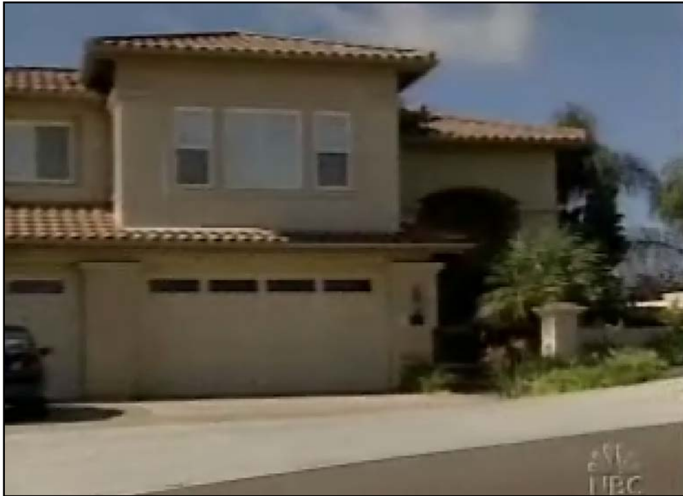
FIGURE 6: San Diego Business Address of North Star Consultants, Inc.