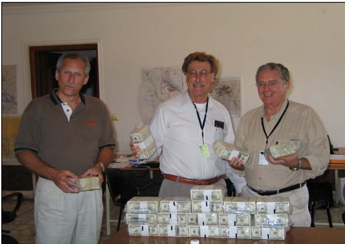
FIGURE 8: CPA Officials Posing with $2 Million in Cash