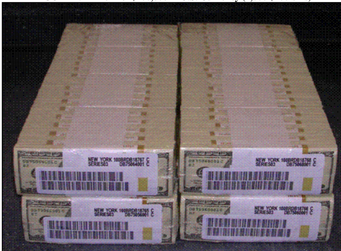
FIGURE 4. “Brick” of $400,000 in U.S. Currency (4,000 $100 bills)