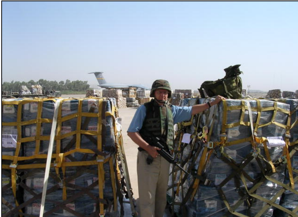
FIGURE 2: Pallets of U.S. Currency Arriving in Iraq

According to internal Federal Reserve Bank records, CPA officials who controlled the DFI and TSPA ordered an initial shipment of currency to Iraq in April 2003, comprising $20,008,000 in $1, $5, and $10 bills. 18 Over the next two months, the shipments became larger: $179,340,000 in May 2003 and $465,920,000 in June 2003. Cash shipments from New York into Iraq continued at an average rate of once or twice a month for the rest of the year: $391,200,000 in July, $808,200,000 in August, $400,000,000 in September, $463,975,000 in October, and $500,000,000 in November.