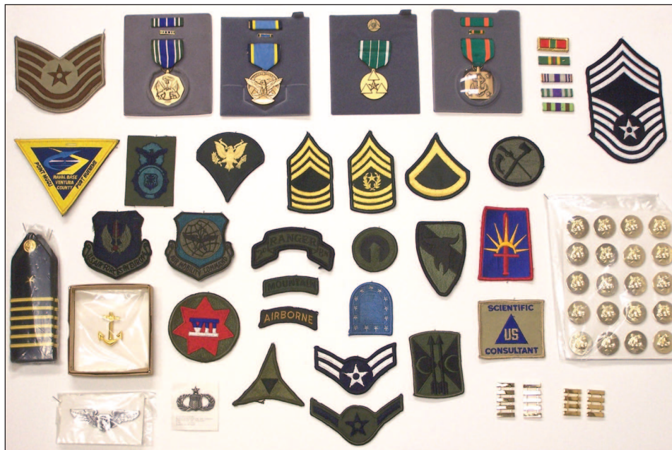
Figure 2: Examples of Excess DOD Badges, Medals, and Insignias Purchased over the Internet in December 2004

Army Rangers, Mountain, and Airborne; Air Force Air Traffic Controller; and DOD Scientific Consultant. Rank insignias include Air Force Chief Master Sergeant and Air Force Technical Sergeant; Navy Captain, Midshipman Lieutenant, and Midshipman Lieutenant Commander; and Army Command Sergeant Major and Master Sergeant. The listed condition code of these items ranged from A4 (serviceable, usable condition) to H7 (unserviceable, condemned condition). However, our inspection of the badges and insignias that we purchased showed that none of them had been used, and many of them were in original manufacturer packages. Further, DOD is continuing to purchase and use most of these items. The photograph in figure 2 shows examples of some of the badges, medals, and insignias that we purchased.