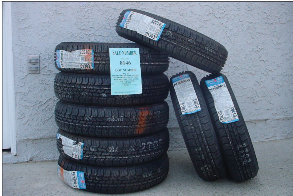
Figure 3: New, Unused Excess Cooper Trendsetter SE Tires Purchased over the Internet in February 2005

forklift. DOD units are continuing to purchase and use these same tires. The most recent purchase of 50 of these tires was made in April 2005. The eight tires had a total reported acquisition value of $404. We paid $113 for the tires, including buyer's premium and tax, and an additional $154 shipping cost. The tires were listed in A4 condition (usable, with some wear). However, we found that the tires still had manufacturer labels on the tread and blue paint over the whitewalls, indicating that they were new and unused. The tires were turned in as excess by the North Island Naval Air Station's Aircraft Intermediate Maintenance Detachment. According to the Army Tank Automotive and Armaments Command Project Officer, 13 the NSN listed on the turn-in document was incorrect. We found that inaccurate item descriptions, including NSNs, prevent items from being selected for reutilization. Figure 3 is a photograph of the excess DOD tires that we purchased over the Internet in February 2005.