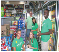
Pictured above are students from Madison and Lamphere High Schools as they work on one of the coalition's sticker shock campaigns.

“11 percent of 8th graders, 22 percent of 10th graders, and 29 percent of 12th graders engaged in heavy episodic, or binge, drinking within the past two weeks.”