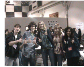
Pictured above are high school students representing various communities enjoying the Youth Advocacy Day Activities.

The youth also had the opportunity to view demonstrations by professional skateboarders and BMX bikers, experience an obstacle course from the National Guard, and music by Magic Firewater and The Jam Society.