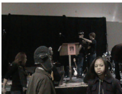
Pictured above are students enjoying the music of Magic Firewater and The Jam Society at Youth Voices and Advocacy Day