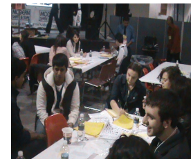
Pictured above are students and adults conversing about key issues of concern to Youth in their communities.