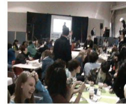
Pictured above are students and adults conversing about key issues of concern to Youth in their communities.

For more information, contact Jennifer Sheridan at (248) 588-5050 x 231 or visit www.ci.royal-oak.mi.us/rocc/index.html