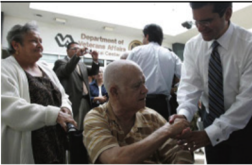
Pierluisi visits Veteran's Hospital in San Juan to discuss equality of services in Puerto Rico