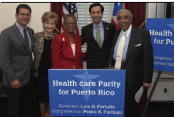
The Resident Commissioner met with Governor Luis Fortuño and other Members of Congress who support Puerto Rico in its fight for parity in health funds.