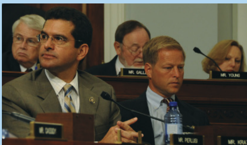
The Resident Commissioner in Congress during the mark-up hearing of HR 2499