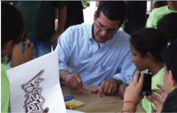
The Resident Commissioner met with students at the Taller de Fotoperiodismo to discuss the importance of education