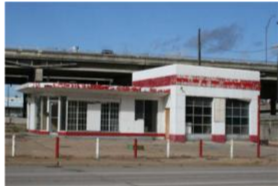
Cities Service Station No. 8 in Tulsa received $30,000 for renovations.