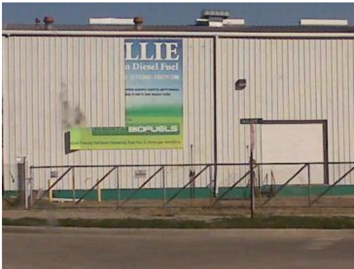
Earth Biofuels facility today.

Armed with the aid of $500,000 in Community Development Block Grant (CDBG) and local community funds that would support other infrastructure improvements and the promise of the $1 per gallon federal tax credit, Earth Biofuels opened their plant in 2006 with plans to hire 100 employees. Its co-founder noted: "we could double our capacity and not meet the demand in Oklahoma alone." Another company official claimed: "we've only scratched the surface of producing quality biofuels and plan to open more plants in Oklahoma." 56