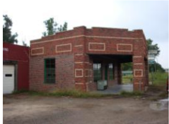
Seaba Station, an antique gift shop near Chandler, received $23,000 for repairs.

The decision was surprising in light of the fact that programs such as this divert important resources needed to maintain our extensive national parks system. Currently, our national parks face a maintenance backlog of nearly $11 billion. 98 Any money that is diverted impacts all of us.