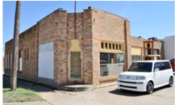
Bristow Firestone service station received a $30,000 grant from the National Park Service to renovate landmarks along Route 66.

Most recently, NPS has provided federal funding to a number of old gas stations, hotels and gift shops. For instance, $30,000 helped to restore an historic filling station in Bristow for use as an auto body repair business 93 , $30,000 was used to renovate an abandoned gas station and used car lot in Tulsa with a new roof, windows, and utilities, along with a new heating and cooling systems, 94 $10,000 was used to replace the roof at the Park Hill Motel in