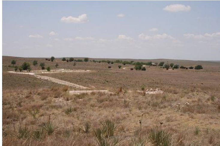
Lake Optima has never filled with water.

One property in particular that highlights the problem is an office that sits next to an empty lake outside of Guymon. The Army Corps of Engineers expends an estimated $15,000 per year maintaining office space at Lake Optima, which has no water. The cost of this property is more than office space, however, and was the subject of nationwide attention when the government set aside $1 million in 2009 for a new guardrail at the property. Amid heavy criticism, the project was cancelled, 78 but a year later the Army Corps spent nearly $150,000 to demolish empty buildings at the site. 79 Statewide, the Corps is maintaining more than 27,000 square feet of office space it deems under-utilized. 80