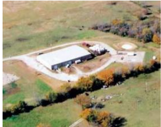
Green Country Biodiesel facility when auctioned in 2008.

In 2005, Green Country Biodiesel opened Oklahoma's first biodiesel facility in Chelsea, with many excited about expanding further. Soon after the facility was announced officials with the U.S. Department of Agriculture showed up to present a ceremonial "Rural Energy for America" check for $65,000, which was the value of the government backed loan. The plan was to expand plant production capacity from 600,000 gallons per year to 2.5 million gallons per year, with plans to reach 30 million gallons and 100 employees. 47