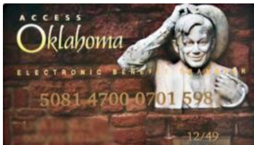
Oklahoma Supplemental Nutrition Assistance Program (SNAP) card

In February 2011, a Tecumseh, Oklahoma man operating a prosthetics limb business was indicted by federal authorities on charges that he illegally sought reimbursement from Medicare and Medicaid without proper prescriptions and in many instances, where no prosthetic was delivered at all. 86 In all, the Federal Bureau of Investigation alleges the scheme netted $5.5 million for the operator, $4.9 million from Medicare and $600,000 from Medicaid. 87