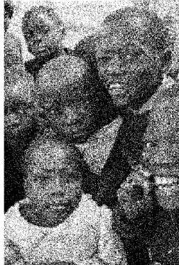
Children participate in Zambia's Africa KidSAFE Alliance for Street Children Program

The Displaced Children & Orphans Fund dedicates resources to the needs of children living and working on the streets, the diverse factors that lead them to a life on the streets, and ways to foster their educational, social, and civic re-integration.