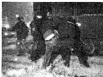
Police arrest an activist near Independence Square in Minsk on December 19, 2010.

[NOTE: The previous article is not reprinted here in its entirety but is available in committee records.]