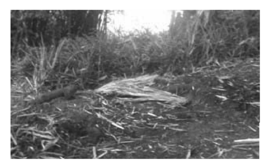
Pic 20: Ruin of SFFO in Tan An Hamlet, Tuyen Quang Province, AFTER the destruction on May 10, 2015