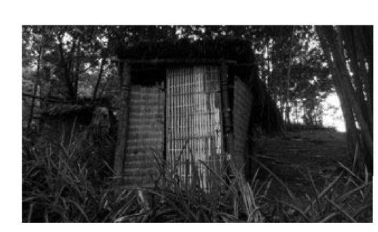
Pic 19: SFFO in Tan An Hamlet, Tuyen Quang Province, built on May 7, 2015