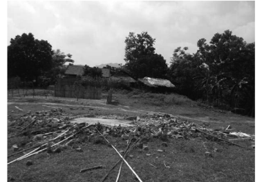
Pic 10: SFFO in Lè Hamlet, Tuyen Quang Province AFTER the destruction on May 26, 2015