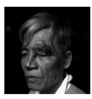
Oct 23, 2011 – Member of the Compassion Baptist Church in Quang Ngai