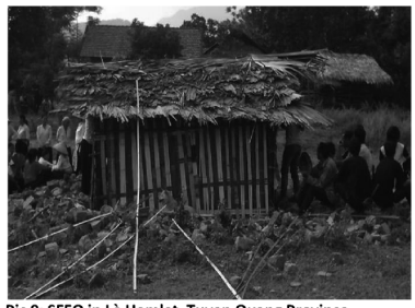
Pic 9: SFFO in Lè Hamlet, Tuyen Quang Province BEFORE the destruction on May 26, 2015