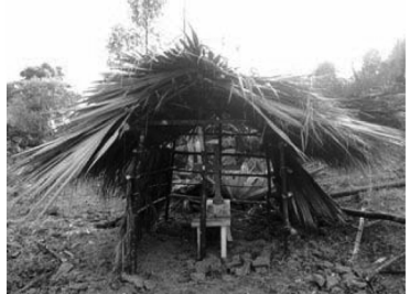
Pic 6: SFFO in Lien Phuong Hamlet, Thai Nguyen Province