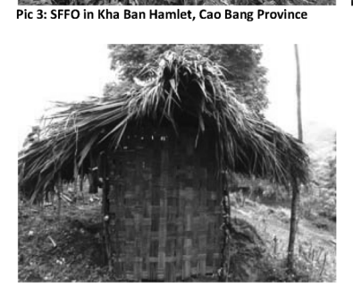
Pic 5: SFFO in Ban Ten Hamlet, Thai Nguyen Province