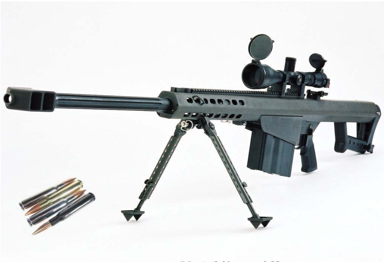
Barrett .50 Caliber Rifle

Law Enforcement Agents Warn Congress They Lack Adequate Tools to Counter Illegal Firearms Trafficking