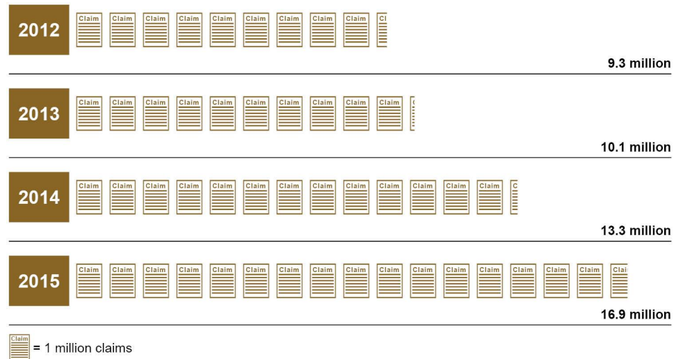
Figure 1: Number of Claims for VA Care in the Community Processed by the Veterans Health Administration (VHA), Fiscal Years 2012 – 2015

GAO-16-353