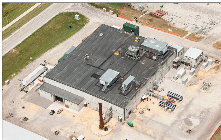
Waste Solidification Building.