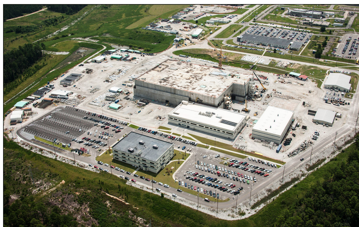
MOX Fuel Fabrication Facility.