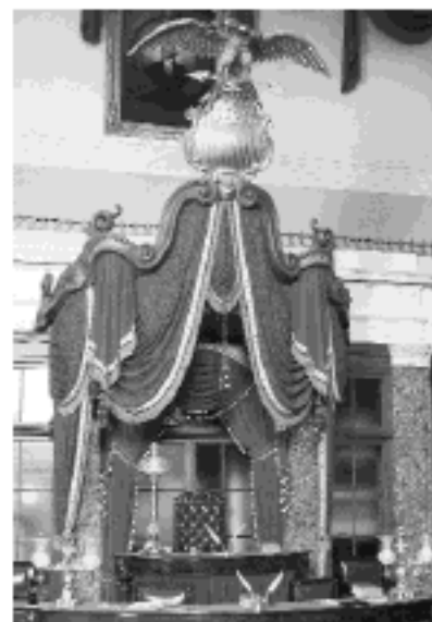
The Old Senate Chamber

The 5-cent issue of President George Washington in the Prominent American Series (1965–1971) was based on the "porthole" portrait of the first president by Rembrandt Peale. Public disappointment with an "unshaven" Washington on the original stamp resulted in a refined version a year later. The Prominent American Series includes 18 stamps, each in a different denomination.