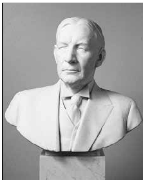
Charles G. Dawes (1865–1951) ③0 Jo Davidson, 1930

design for the American buffalo nickel. More than 25 years after sculpting the Roosevelt bust, Fraser created the marble bust of Vice President John Nance Garner for the Senate collection.