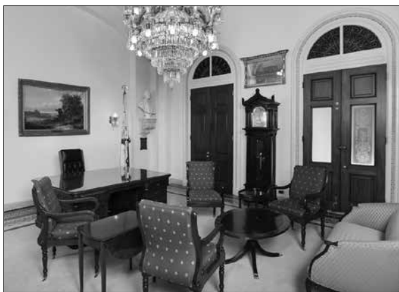
The vice president's Capitol office

The United States Senate's Vice Presidential Bust Collection honors the presidents of the Senate and forms the institution's oldest continuing art collection. The Senate commissioned the first bust in 1885 as a tribute to Vice President Henry Wilson and placed it in the Vice President's Room, adjacent to the Senate Chamber.