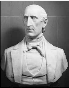
John Tyler (1790–1862) 10