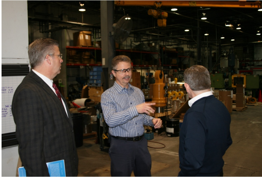
(Rep. Hultgren tours the Miner Elastomer plant in Geneva)