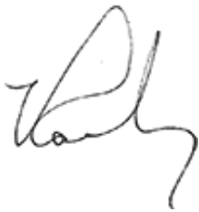
Randy Hultgren Member of Congress 14th District, Illinois