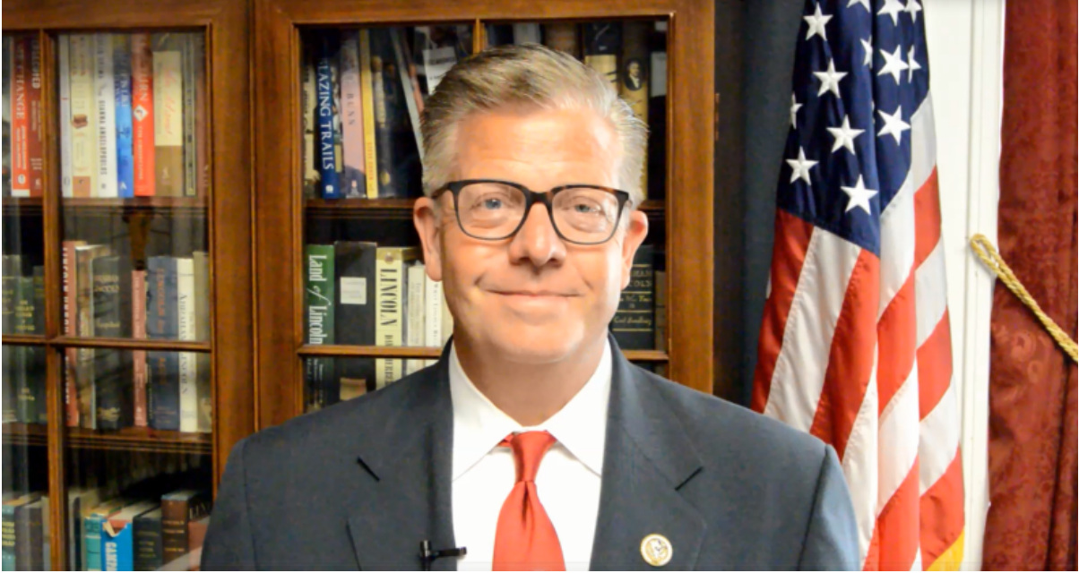
(Click picture to watch video)

We had a busy week in Washington on issues like providing funding for our veterans and their families, maintaining the salary freeze on Congress, discussing solutions for DACA recipients and more. Watch below: