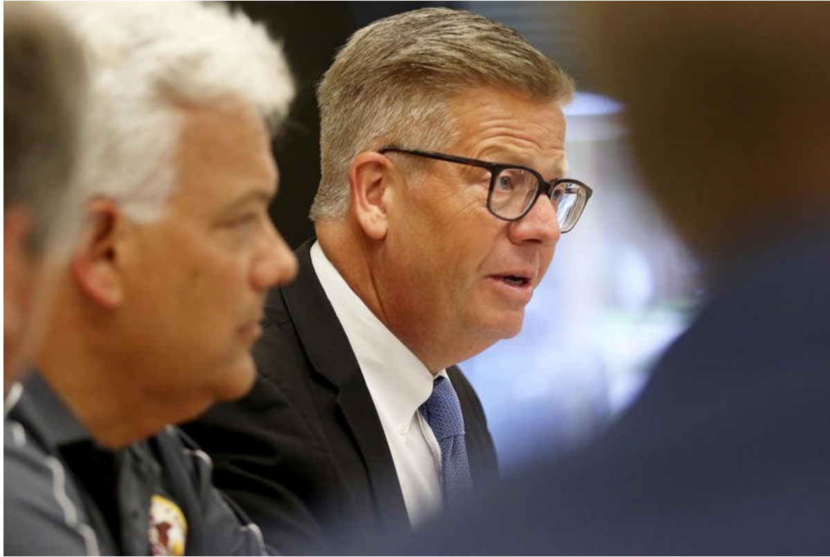
(Rep. Hultgren hosts manufacturing event.)

Last week we had a fantastic discussion at the McHenry County Workforce Center where we tackled how to support Illinois' manufacturers and small businesses, the skills gap and getting the next generation excited about jobs in manufacturing and other STEM fields. Manufacturers are in need of a pipeline of students and recent graduates who are excited about the field and can gain needed skills and abilities from our local community colleges and on the job.