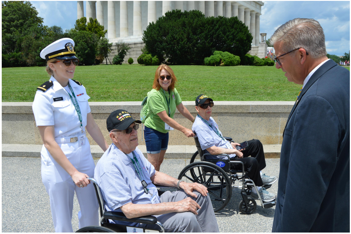
(Rep. Hultgren greets veterans of the Korean War)