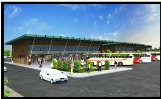
Figure 1. Proposed Terminal/Checkpoint

Without a modern terminal environment, trainees must rely on workarounds to substitute for the proposed transportation terminal/checkpoint, preventing exposure to real-life training scenarios. As a result, trainees will be less prepared for duties associated with transportation terminals, potentially impacting safety risk and detection of illegal activity.