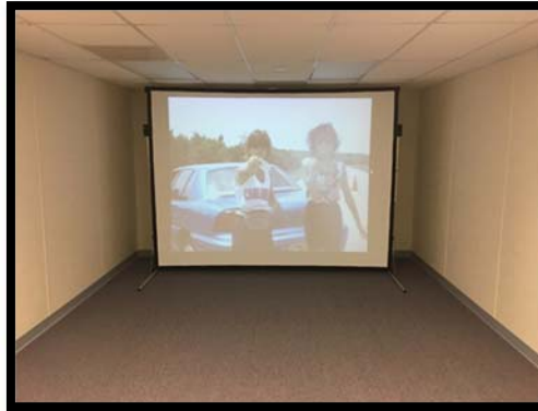
Figure 4. Current Training Environment