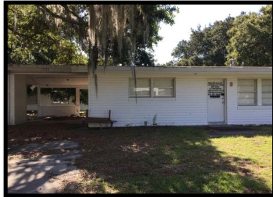
Figure 6. Backup Venue — Old Navy Housing

Additionally, these secondary venues may not always facilitate a safe environment for training. For instance, as outlined in our FLETC Warehouse Management Alert, issued in December 2017, 9 USBP’s Border Patrol Academy continued to use a warehouse 10 for training at FLETC in Artesia, NM, even though the warehouse sustained structural damage that posed a potential safety hazard to instructors and trainees.