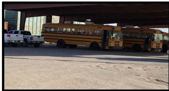
Figure 2. Current Training Environment

The Proposed VIRTRA 300 Judgmental Use of Force Simulator — This venue would provide a multi-dimensional presentation of threats. It was redesigned after USBP agents in the field reported a need for improved preparation for their work environment. As outlined in USBP’s training venue improvement