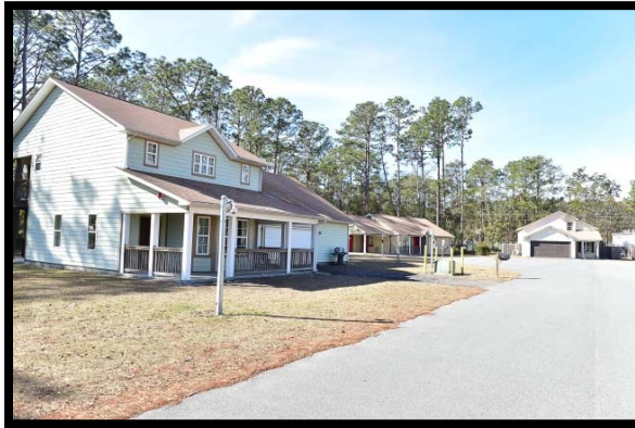
Figure 5. Preferred Venue — Danis City