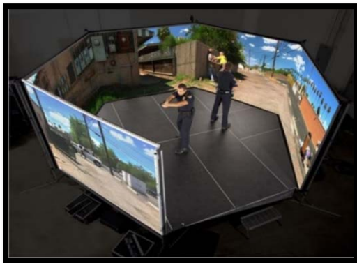
Figure 3. Proposed VIRTRA 300 Simulator

“The VIRTRA is already in use in the field for USBP personnel to complete quarterly & semi-annual training. The system at the Border Patrol Academy is not only outdated but also is a system no longer used anywhere else within CBP.” – CBP Office of Training and Development Official