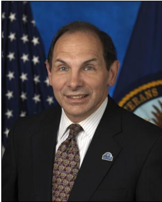
Secretary Robert A. McDonald

“.....it is critical that all of us at VA reaffirm our commitment to our mission and our values. Our commitment to serving Veterans must be unquestioned. Veterans must know that we are “all in” when it comes to accomplishing our mission and living by our values.