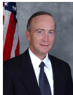
Mitch Daniels Governor