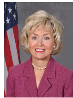
Becky Skillman Lt. Governor