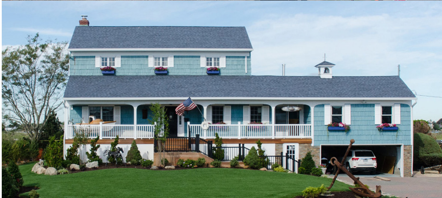
Project example: House Elevation – Freeport, New York