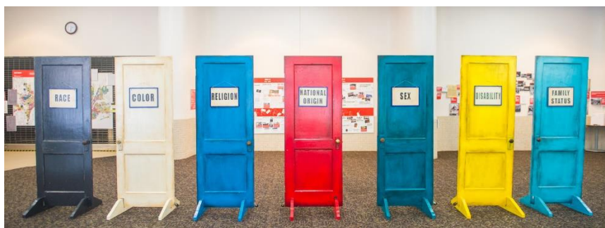
"Opening Doors" Art Installation