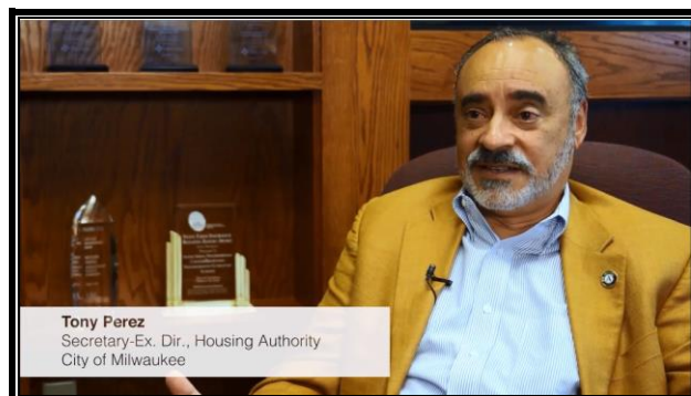
Westlawn Gardens Video

We endeavor to see more public housing communities adopt similar strategies and create a healthy, sustainable living environment for families. Through a holistic, community-based design process, Westlawn Gardens is successfully being transformed from an aged and stressed community into a lively, mixed-use, mixed-income neighborhood.