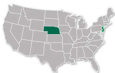
Figure 3. Indicator rankings for population of people with intellectual disabilities, (n = 12 states)