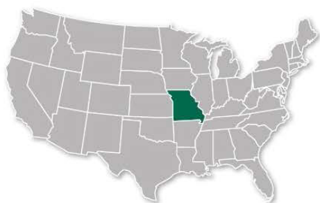
Figure 1. Indicator rankings for older adult population, (n = 15 states)