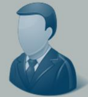
Adults age 19-64