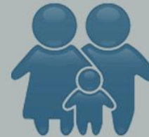
Parents and caretaker relatives