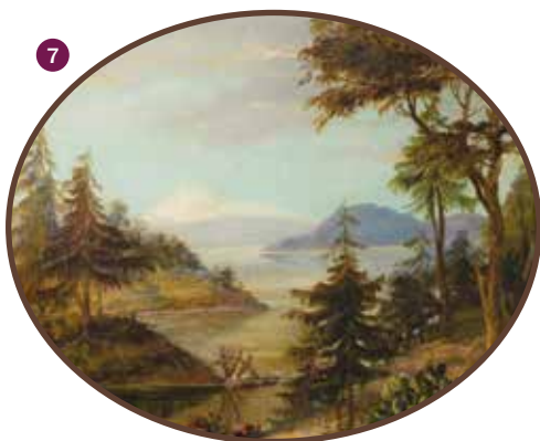
Mount Baker (Washington)