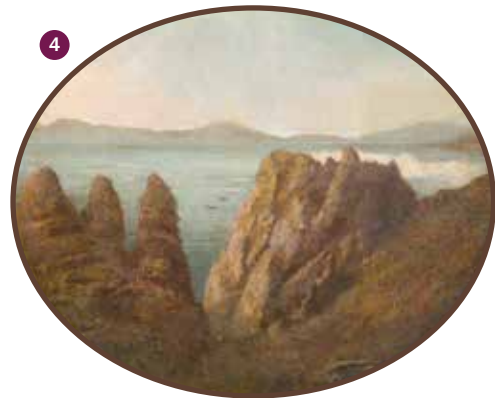
Valley of Franklin River (Nevada)