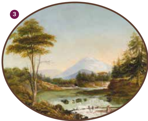
Bitterroot River (Montana)