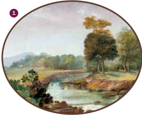
Bois de Sioux River (Minnesota)