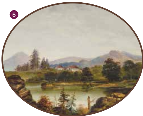
Coeur d'Alene River (Idaho)