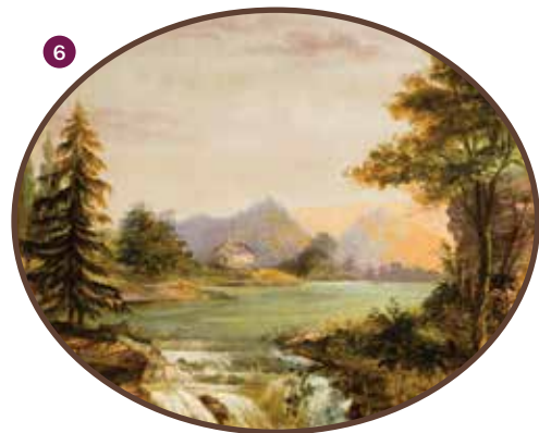
Hudson Bay Mill (Washington)