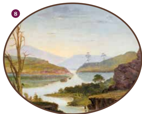
Cape Horn (Washington)