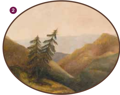
Sangre de Cristo Pass (Colorado)