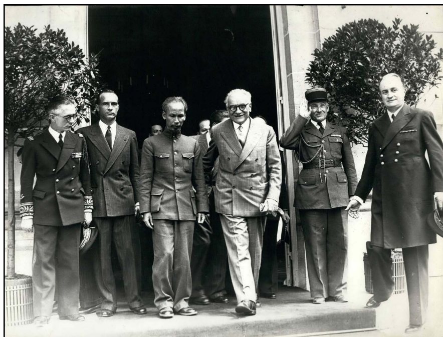
The OSS did not put Ho in power, but it was not without blame in his rise to leadership in Vietnam. Here he is shown after a meeting with French Foreign Minister Bidault in Paris in April 1946.

People also say that as a result of our support, Ho came to power. I don’t believe that for a minute. I’m sure Ho tried to use the fact that the Americans gave him some equipment. He led many Vietnamese to believe