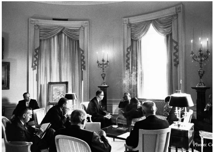
Freshly informed by CIA assessments contradicting a supposed pessimistic Israeli estimate of Arab military capabilities, Johnson, in the presence of Secretary McNamara and other senior officials, hears out Israeli Ambassador Abba Eban on 26 May 1967.

Helms had the Office of National Estimates (ONE) prepare an appraisal of the Mossad assessment, which was ready in only five hours. ONE flatly stated: “We do not believe that the Israeli appreciation . . . was a serious estimate of the sort that would submit to their own high