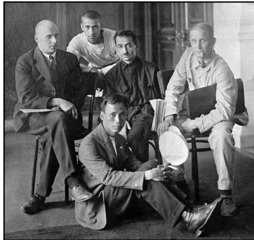
Ho Chi Minh, sitting on the floor, with other attendees of the 5th Comintern meeting held in 1924 in Moscow.

. . . the young men of the OSS were no match for Ho's charm and cleverness, and his manipulative skills honed over 25 years as an agent of the Comintern.