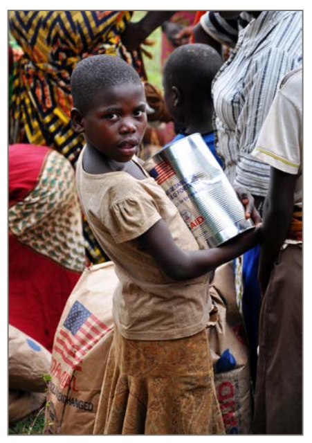
Recipient of vegetable oil - Food for Peace program - Photo by Caine A. Cortellino, Save the Children USA