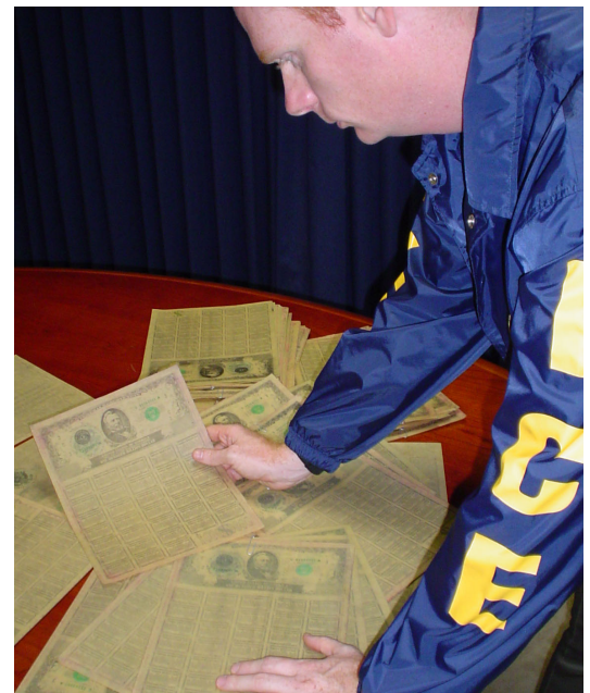
An ICE agent shows a sample of the counterfeit bonds used in a recent Fictitious Instrument Fraud scheme. The worthless phony bonds, seized in September in San Diego, were purportedly found in the wreckage of a plane in the Philippines and offered for sale to "investors" in the United States.

To learn more about Fictitious Instrument Fraud, visit the U.S. Bureau of Public Debt Web site at www.treasuryscams.gov . The site features examples of various types of fictitious instrument schemes and related scams.