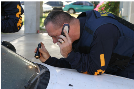
An ICE agent inspects the vehicle identification number on a car seized as evidence after ICE, working with authorities in Arizona, shut down a major smuggling transport scheme.

A task force comprised of ICE agents and state officials uncovered an elaborate scheme under which used car dealers provided criminal organizations with untraceable used cars that the criminal groups could use to smuggle illegal immigrants, cash or drugs.