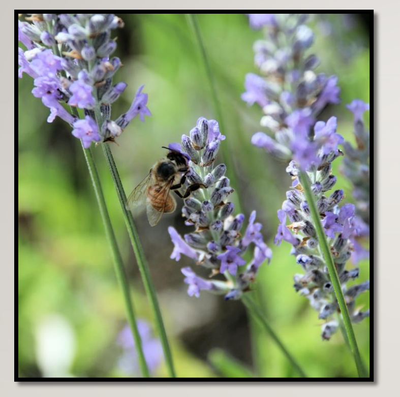
Category: Ag Animals Virginia Lane, Linn Co.