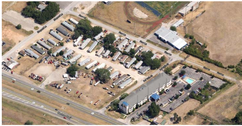
Trailer park acquired with noise land funding

The Airport's noise program consists of 145 parcels which total to 192 acres. The Airport's funding for the program is a combination of Airport Improvement Program (AIP) grants and Airport revenues. The Airport began its program in 2005, and has almost completed the cycle of acquisition and disposal. One remaining item is the relocation of a mobile home park. The Airport acquired the park from its owner and is now relocating the residents. Austin Energy and the Austin Police department acquired some parcels. Austin Energy obtained its parcels through a bid process, and the Police paid for their parcels by paying the appraised fair market value. The Airport converted three parcels (ND 109, 110, and 111) to AIP eligible airport use. It sold the remaining parcels through a bid process. The Airport invested all sales proceeds ($1,834,251) in AIP eligible projects. The FAA regional office approved all the acquisitions and dispositions of the parcels. The Airport did not convert any of the land to parks, recreation, or noise barrier use.