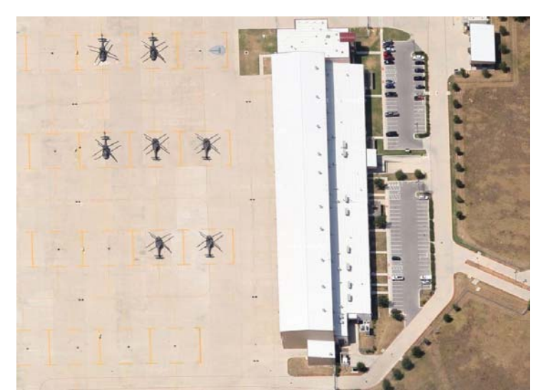
Texas National Guard Helicopter Unit