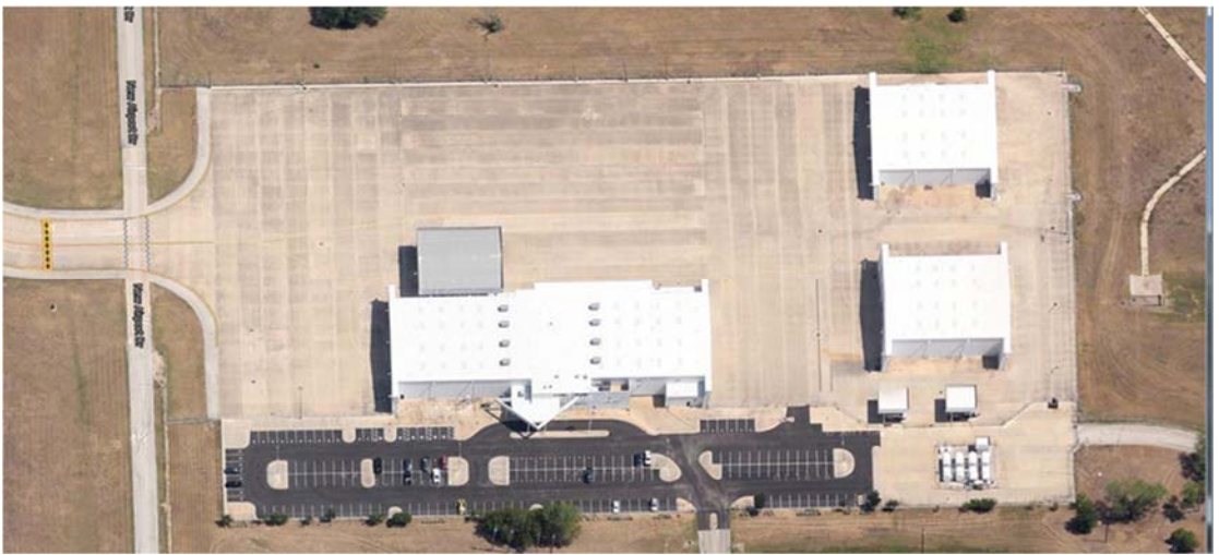
State of Texas Hangars

Conclusion: The Airport needs to ensure the State of Texas is paying rental rates that are compatible with other aeronautical users.