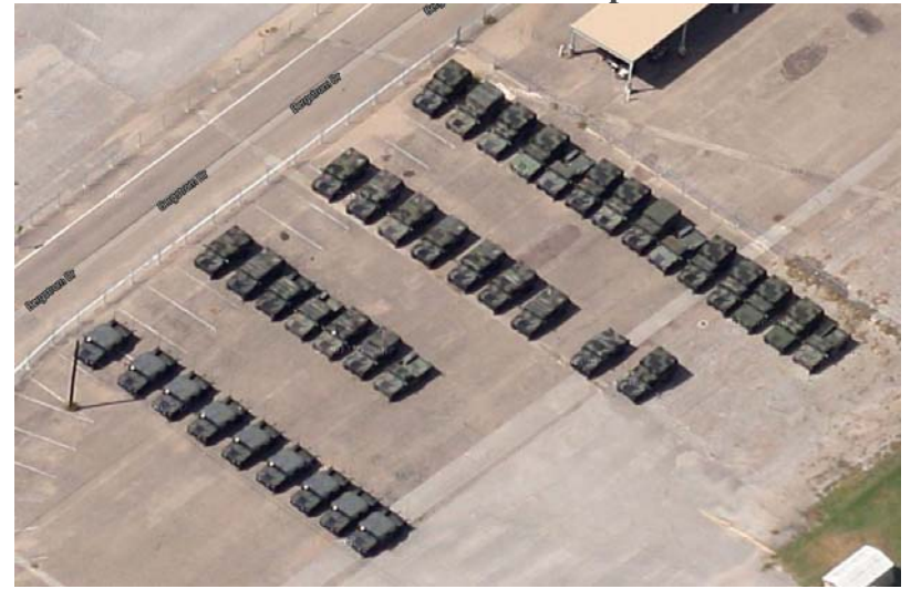
Texas National Guard Non-aeronautical use