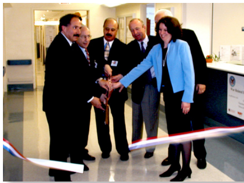
ONE OF THE FIRST WRIISCS WAS ESTABLISHED IN 2001 AT EAST ORANGE, NJ

OVER 15 YEARS AGO , in response to Public Law 105-368, VA contracted with the National Academy of Sciences (NAS) to develop a plan for establishing National Centers for the study of war-related illnesses and post-deployment issues. On November 5, 1999, the NAS recommended that VA establish centers for the study of war-related illnesses similar in structure to VA's Geriatric Research, Education, and Clinical Centers. In 2001, after a competitive review process, the first two WRIISC centers were established; one at the Washington, DC VA Medical Center and the other at the East Orange Campus of the VA New Jersey Health Care System. To provide wider coverage and easier access for Veterans, an additional WRIISC was authorized and became operational at the VA Palo Alto Health Care System in Palo Alto, CA in February 2008. The three-part mission at the WRIISC: clinical, research, and education has always worked together to better understand the health issues facing deployed Veterans, provide state-of-the-art care and services to Veterans, and educate providers, Veterans, their caregivers, and family members. Through clinical care, we determine gaps of knowledge in Veterans' care and this helps us