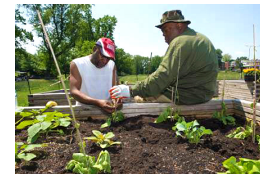
VETERANS PLANT VEGETABLES IN THEIR "ALL VETERANS' GARDEN."

IN JUNE 2012 , the DC WRIISC led a group of volunteers in the inaugural planting of what would become the "All Veterans' Garden."