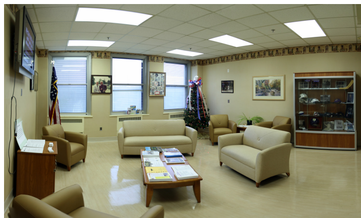
The Transition Unit's reception area at the 7th floor, East Orange campus of the VA New Jersey Health Care System

When Veterans take initiative to come to the Transition Unit, they receive a warm welcome from a caring, committed team and have an opportunity to get help with their medical and psychological conditions, readjustment to civilian life, and connecting to community resources. Transition Unit staff members are a linkage to other medical services at the VA including primary medical care, mental health care, readjustment counseling, employment assistance, - and many times - the WRIISC. They also help to coordinate a plan for a Veteran and "supervise" the next steps.