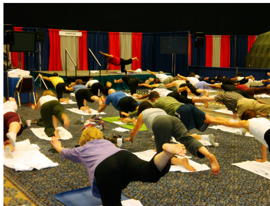
Conference attendees strike a pose, called hands and knees balance . This yoga position's benefits include improved balance and core strength.