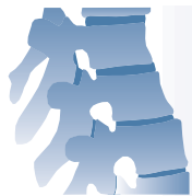
TABLE 2-1. SIGNS AND SYMPTOMS AND DIAGNOSTIC CONCERNS