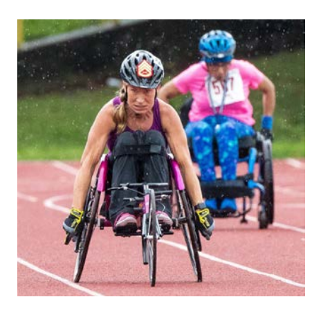
National Veterans Wheelchair Games (NVWG), founded in 1981, serves Veterans with spinal cord injuries, multiple sclerosis, amputations, stroke, and other neurological disorders that are eligible

NVSP&SE office directs six national programs delivering direct patient care to Veterans under the authority of 38 United States Code 322. These programs embrace formalized adaptive sports medicine as a practice specialty and provide the largest coordinated therapeutic arts program for Veterans. The programs are built on clinical expertise within VA, with essential support from Veteran Service Organizations, corporate sponsors, individual donors and community partners.