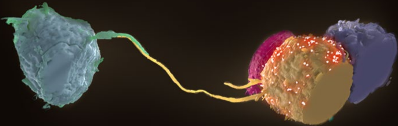
A long filopodial extension connects an uninfected T cell (blue) and an HIV-infected T cell (yellow). Data from focused ion beam scanning electron microscopy (FIB-SEM).