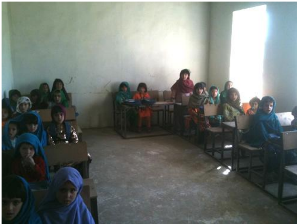
"Hey guys. This is a picture from the first girls' school here — we just opened it. Felt good."