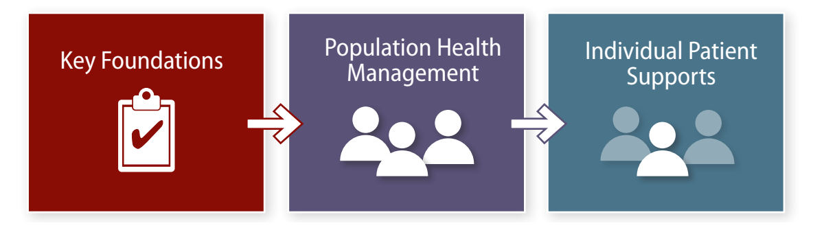
Figure 1. Hypertension Control Change Package Focus Areas

While the science behind cardiovascular risk reduction is continually evolving, there is strong evidence that a systematic approach to HTN management can significantly improve HTN-related care processes and outcomes. The purpose of the HCCP is to help healthcare practices put systems in place to care for patients with HTN more efficiently and effectively. The HCCP is broken down into three main focus areas (Figure 1):