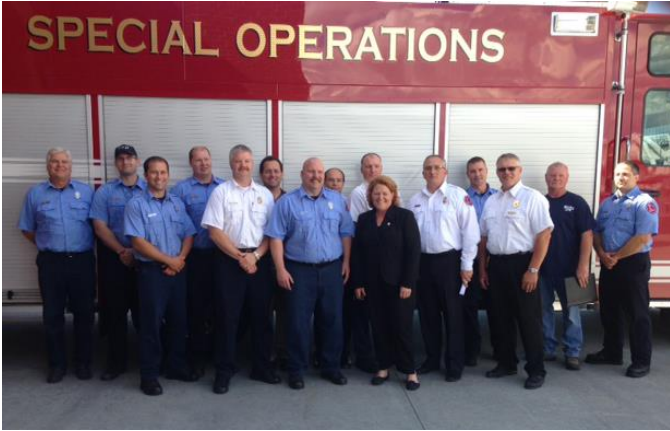
Sen. Heitkamp at Fargo Fire Department in June 2014 to unveil her RESPONSE Act.

it was introduced in February 2015 by U.S. Representative Ron Kind (D-WI).