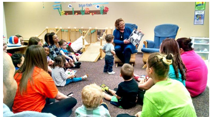
Sen. Heitkamp reads with young North Dakotans at Minot Head Start in May 2016.