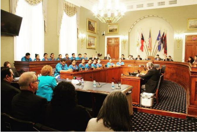
Sen. Heitkamp testifies on behalf of her bill that would create a Commission on Native Children at a U.S. House of Representatives Committee hearing in May 2016.

bipartisan bill to improve the lives of Native American children passed in a committee in the U.S. House of Representatives – the final step before a full vote in the House. Senator Heitkamp testified at a congressional hearing in the House on in May 2016 in support of this important effort.