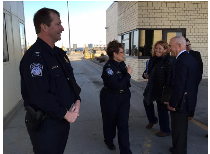
Sen. Heitkamp and second in command at the U.S. Department of Homeland Security talk with Border Patrol officers at the Pembina Area Port in April 2015.

In May 2016, Senator Heitkamp brought Federal Communications Commission (FCC) Commissioner Jessica Rosenworcel to North Dakota to discuss the E-Rate program, which helps provide high-speed internet in schools and libraries, and the need to expand internet and cellular service on Indian reservations. Senator Heitkamp has also pressed other top federal officials about the need to fill these gaps.