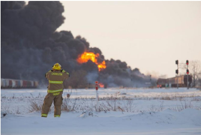
First responder looks on following train derailment near Casselton in December 2013.

Despite the current downturn in oil production, more than 30 percent of North Dakota crude oil is still being transported by rail, according to the North Dakota Department of Mineral Resources. On major freight railroads across the country, the number of railcars carrying crude oil grew by more than 4,000 percent between 2008 and 2013, with additional increases in 2014. From local fire departments to volunteer ambulance services, first responders need to be prepared to handle potential incidents on the rails and remain safe as they work to protect North Dakota's families and communities.