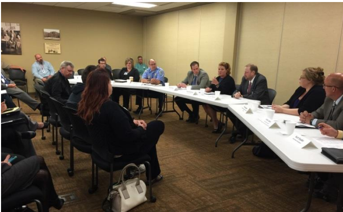
With community leaders in Bismarck, Sen. Heitkamp discusses a community approach to combat opioid and heroin abuse in May 2016.

In May 2016, Senator Heitkamp helped introduce the LifeBOAT Act to provide needed federal funds for opioid intervention and treatment resources, which would help North Dakota communities fight opioid abuse. She unveiled the bill during a discussion in Bismarck with area leaders to talk about the needs of the Bismarck community to build a coordinated effort against opioid abuse.