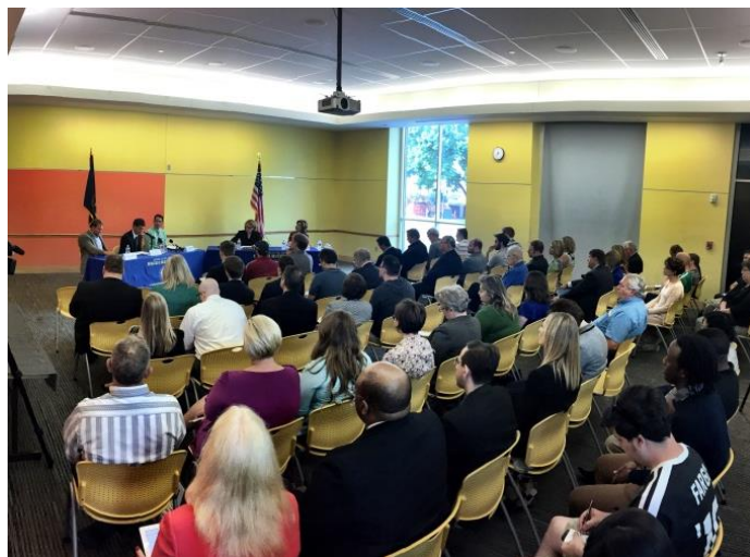
Sen. Heitkamp holds U.S. Senate Field Hearing about supporting rural startups in Fargo with the head of the U.S. SBA in July 2014.

To support North Dakota's quickly growing startup community and entrepreneurs, in March 2016, Senator Heitkamp introduced her SEED Act to address challenges facing startups in North Dakota, as well as other rural states and small cities, by helping them get the early stage funding they need to grow their businesses. In July 2014, Senator Heitkamp brought the head of the U.S. Small Business Administration (SBA) to Fargo where Senator Heitkamp held the first U.S. Senate Committee on Small Business & Entrepreneurship field hearing in North Dakota. The hearing focused on the roadblocks local entrepreneurs often face in obtaining the small funding they need to start or grow their businesses, which paved the way for the SEED Act.