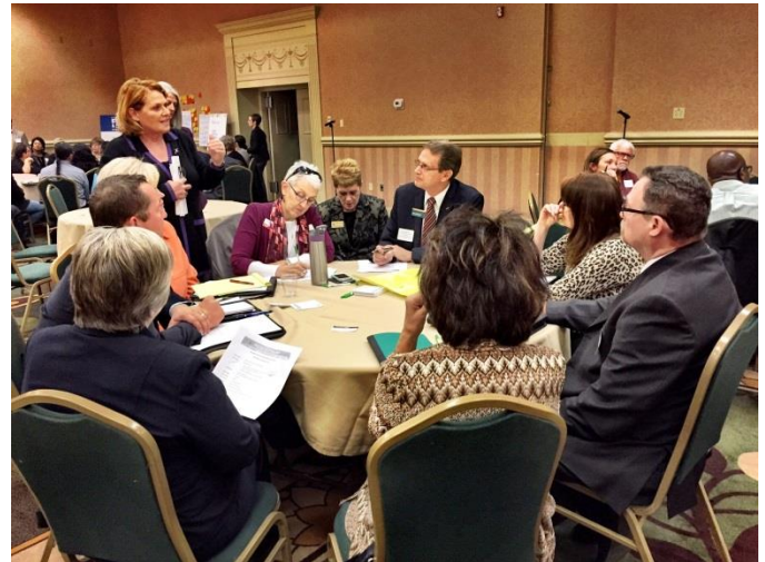
Sen. Heitkamp talks with Task Force members at the Strong & Safe Communities Summit in October 2015.

state faces. She also held her Strong & Safe Communities Summit in October 2015 which brought together about 150 community leaders from across North Dakota, including Task Force members, to discuss solutions to build a strong future for the state.