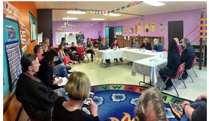
To better support working families, Sen. Heitkamp and U.S. Senator Kirsten Gillibrand (D-NY) meet with local leaders and parents in Jamestown to discuss the FAMILY Act in April 2016.