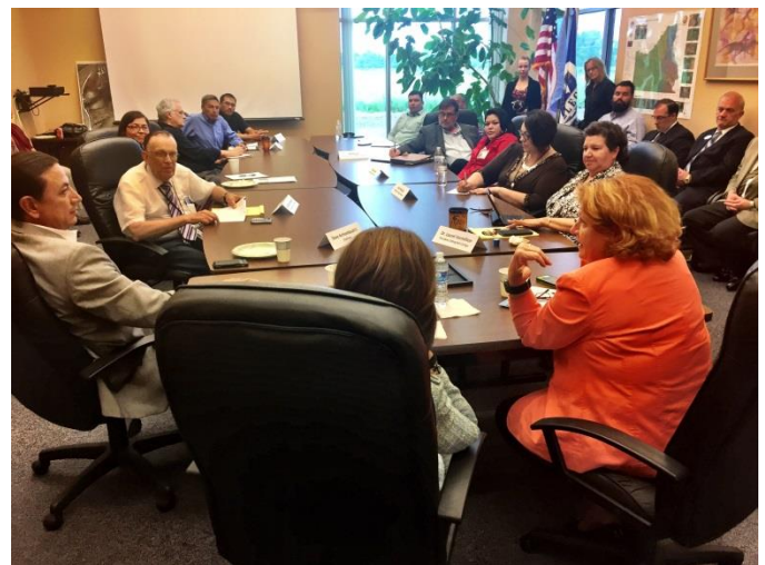
SBA Administrator, Sen. Heitkamp, and tribal leaders discuss new programs to support training and resources for Native American small businesses and entrepreneurs in July 2015.

To help promote economic development in Indian Country, Senator Heitkamp brought the head of the U.S. Small Business Administration, Maria Contreras-Sweet, to Standing Rock where they announced new training, resources, and support for Native American small businesses and entrepreneurs.