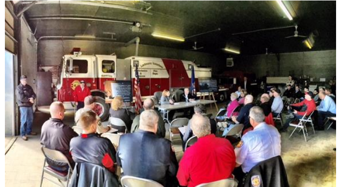
In March 2015, Sen. Heitkamp and the second in command at the U.S. Department of Homeland Security met with volunteer firefighters in Larimore.

received training at the facility between 2007 and May 2016.