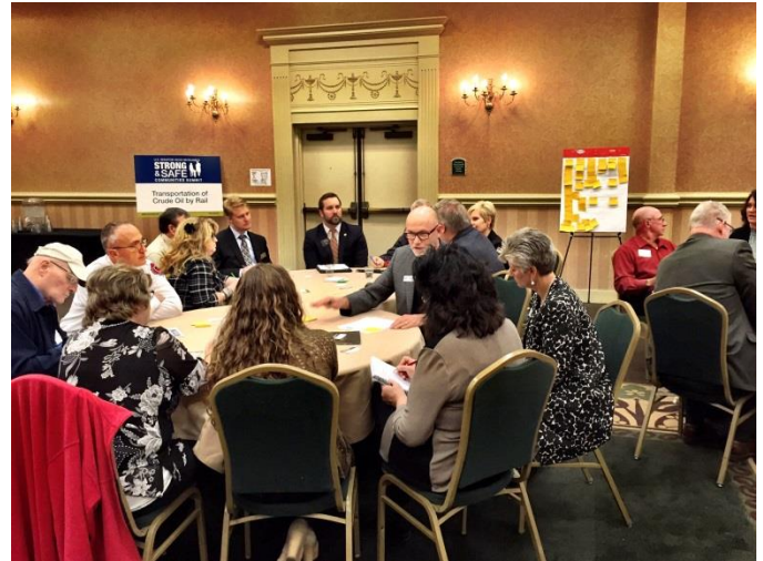
Community leaders discuss issues facing North Dakota at Sen. Heitkamp's Strong & Safe Communities Summit in October 2015.

At the Summit, each breakout group was asked to identify three key challenges and brainstorm bold ideas to address each one. The conversations at the Summit sparked a wide array of ideas and included action from every level of government and the private sector. It was the type of broad, solution-based thinking that is needed to overcome the difficult challenges facing North Dakota's communities.