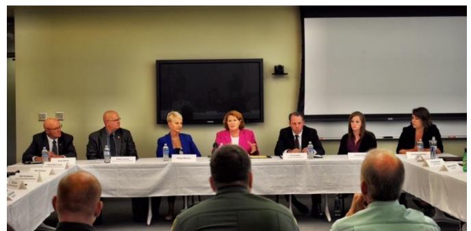
Sen. Heitkamp, national and global anti-trafficking leader Cindy McCain, and local leaders discuss best practices to combat human trafficking in Bismarck in June 2015.

For several years, Senator Heitkamp has worked closely with Cindy McCain – a national and global leader in the fight against human trafficking – and brought her on a three-day tour of western North Dakota and MHA Nation to discuss with local leaders best practices to help eradicate human trafficking from the state. She also brought the head of the U.S. Department of Homeland Security's (DHS) Blue Campaign – DHS' national effort dedicated solely to combating human trafficking – to North Dakota, as well as leaders of the organization, Truckers Against Trafficking.