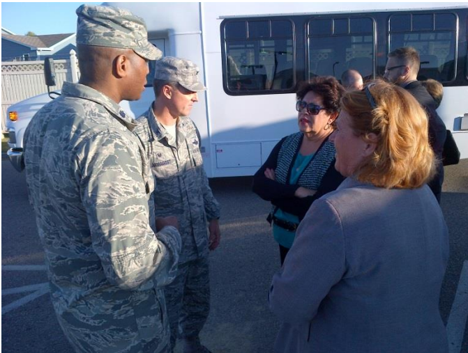
In September 2014, Sen. Heitkamp brought then-head of U.S. Office of Personnel Management to Minot Air Force Base to discuss needed changes to better recruit and retain federal workers.

In August 2014, Senator Heitkamp helped the White House drug czar announce his new national strategy to fight drug crimes in the Bakken and at the Northern Border, which she specifically pushed for.