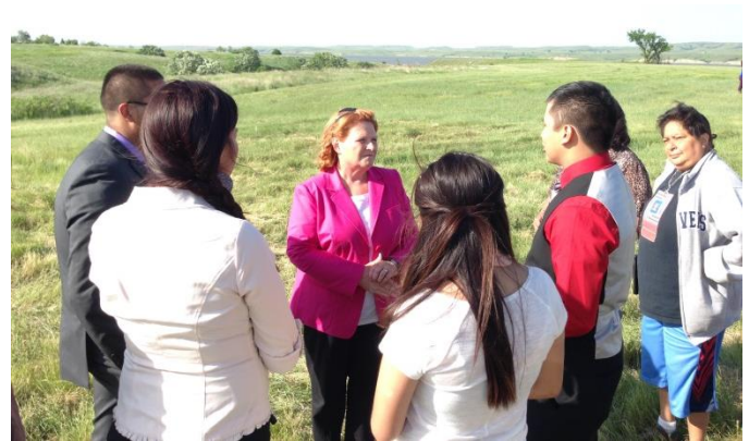
Sen. Heitkamp talks with Native youth on the Standing Rock Sioux Indian Reservation in June 2014.