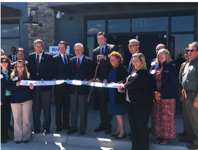
Sen. Heitkamp, FBI Director Comey, and local, state, and federal officials at the ribbon cutting of new FBI facility in Williston in June 2016.