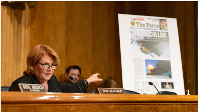
Sen. Heitkamp speaks at U.S. Senate hearing on the train derailment near Casselton in March 2014.