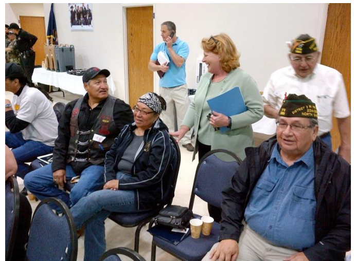
Sen. Heitkamp talks with folks at her first Native American Veterans Summit in June 2014.