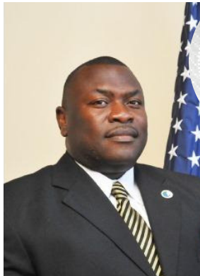
Mayor Terrill Hill