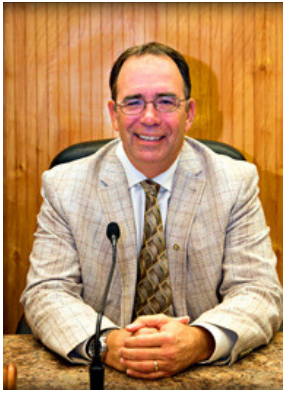
Mayor Brett Peterson