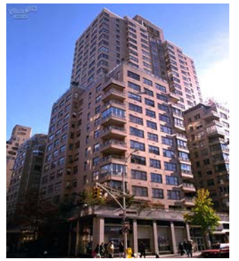
Salem Community College, Carney's Point, New Jersey:

During Hurricane Sandy, the Brevoort Co-op was the only building on lower Fifth Avenue able to provide energy and full service to its residents thanks to its 400 kilowatt (kW) CHP system. The building has 277 units, and typically houses 720 residents. However, those numbers swelled to 1,500 after the storm as Brevoort residents took in friends and family members without power.