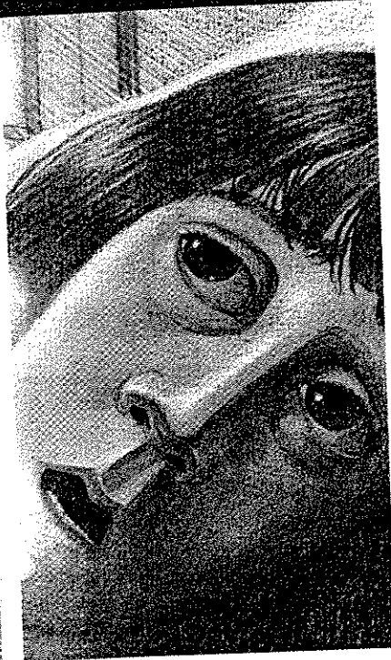
Detectors for the hearing-impaired..... 26