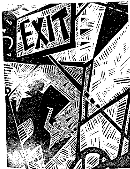
Emergency lighting..... 48