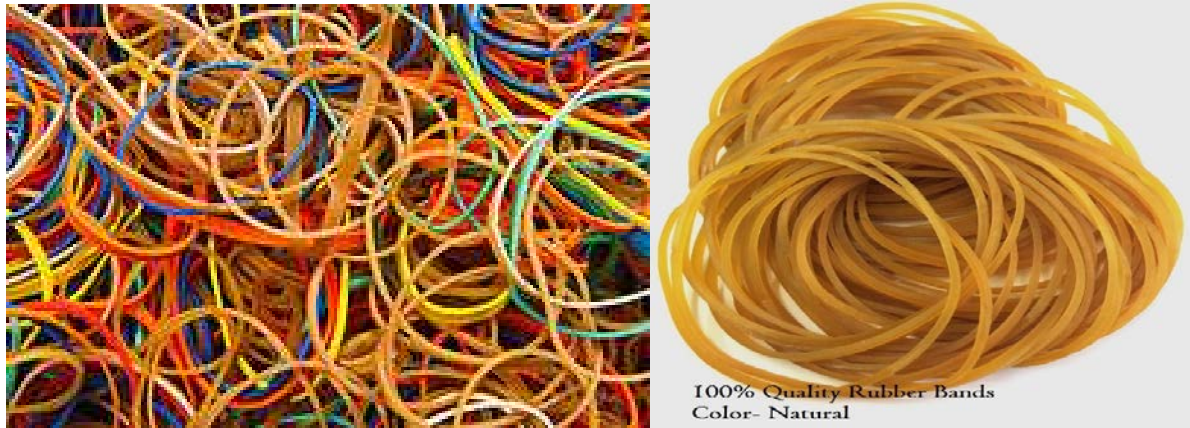
Figure I-1 Rubber bands: Assorted colors and sizes