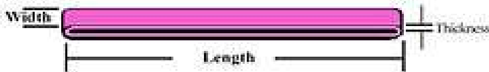
Figure I-2 Rubber bands: Standardized dimensions

Rubber bands' sizes are generally standardized by producers into a specified numbering system series detailing lengths and widths, beginning with the series of smaller numbered widths, while the relatively smaller thicknesses, e.g. 0.020 inch to 0.125 inch, may or may not be addressed. Length is always specified as the "lay flat" length, as measured with the cylindrical band flattened on its side as shown in the following diagram (figure I-2).