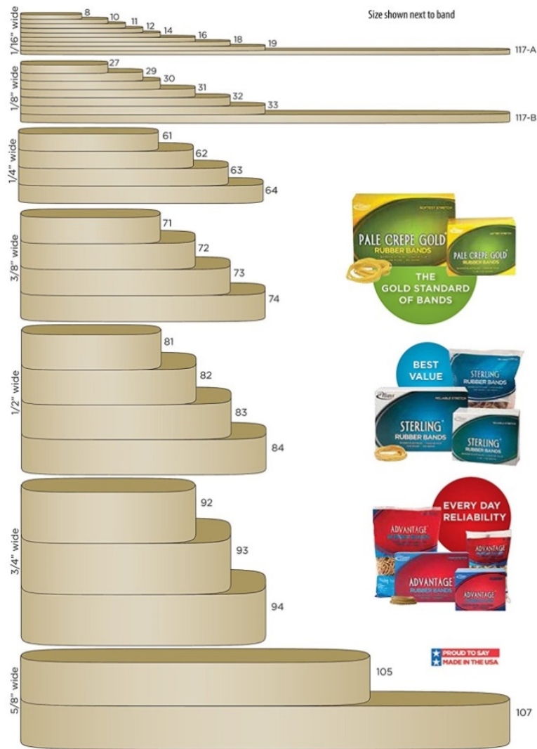
Rubber bands: Major groupings of standard natural rubber band sizes