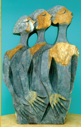
Welcoming visitors is The Messengers, a sculpture by Lameck Bonjisi of Zimbabwe. CDC exhibits the work as a symbol of the museum's mission to educate all who visit about the interplay of public health, culture, and community.