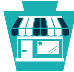
Existing Business Owner

These symbols are used to denote which sections are more useful for new entrepreneurs and which ones contain information geared toward existing business owners. Sections not designated by either icon contain information that is relevant for both types of entrepreneurs.