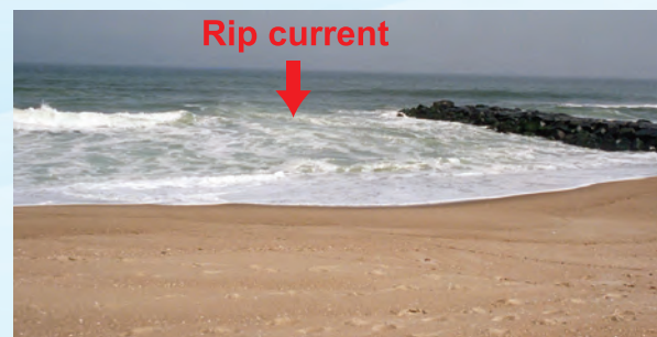
Rip currents often form near coastal structures.