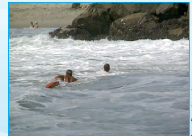
A lifeguard rescues a swimmer caught in a rip current.